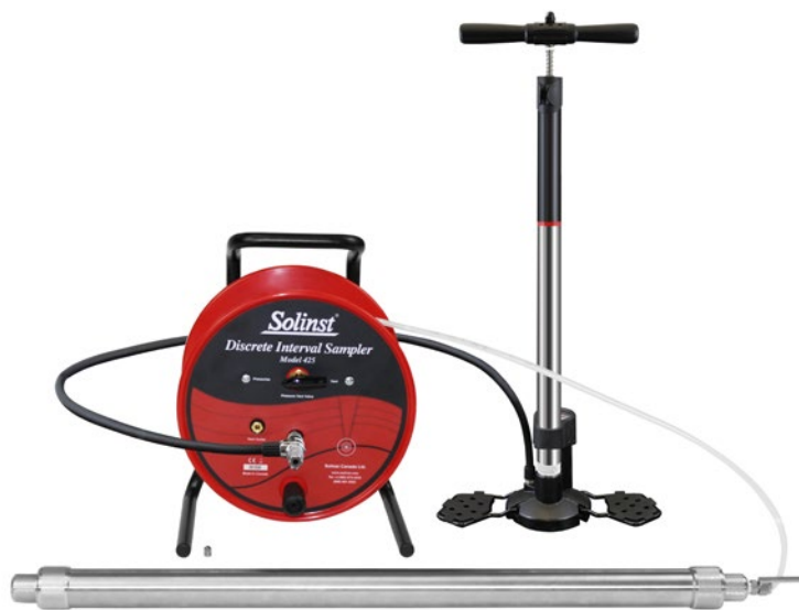
1.66"ø Discrete Interval Sampler with High Pressure Hand Pump

These sampling methods are based on the principle that groundwater which flows into a well, maintains equilibrium with the adjacent water bearing unit. Sampling at the discrete interval should result in representative samples, without the need for purging.