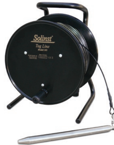
Tag Line / Suspension Cable