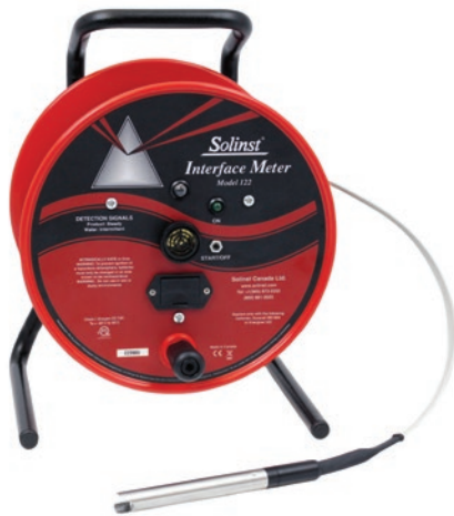
Oil/Water Interface Meter